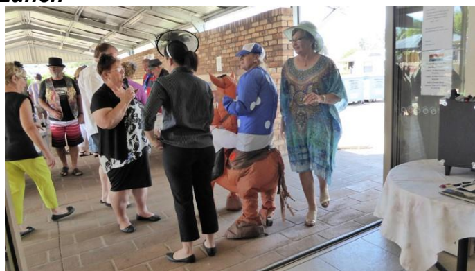
Some of our members enjoying a drink