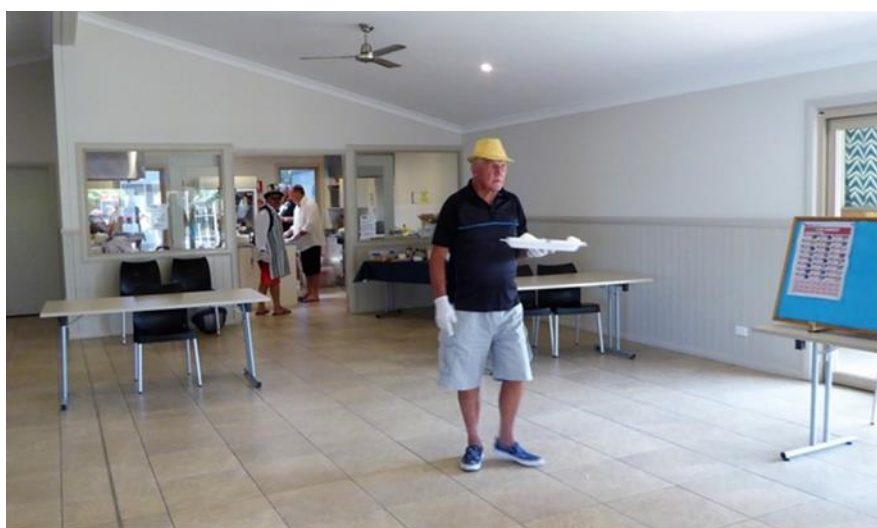
Some of our servers and preparers