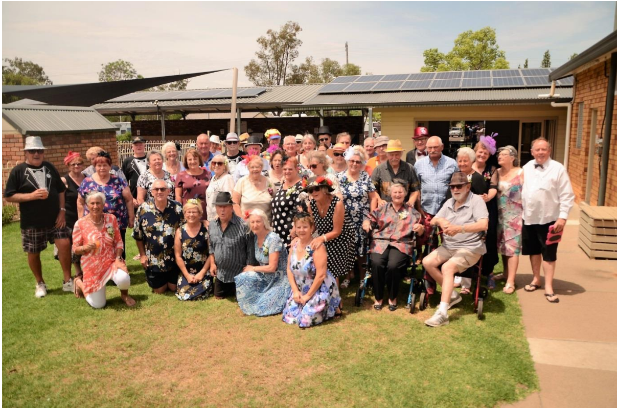
Group Photo for Melbourne Cup Day

Please forward any photos, (can be incriminating!) or reports for the enjoyment of our members.